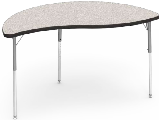
Fashion Grey #D381-01 Laminate

Activity Table, Nest shape, 30"W x 54"L, (adjustable height 22"-30"H) , Dry Erase Surface with black band edge, (2 placed together make a round table)