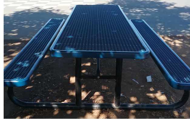
Rectangle Shape Outdoor Table, 8 ft. long, Seats 10-12

Can be used outside the classroom(s) for outdoor learning if space is available, may also be used in lunch area(s).