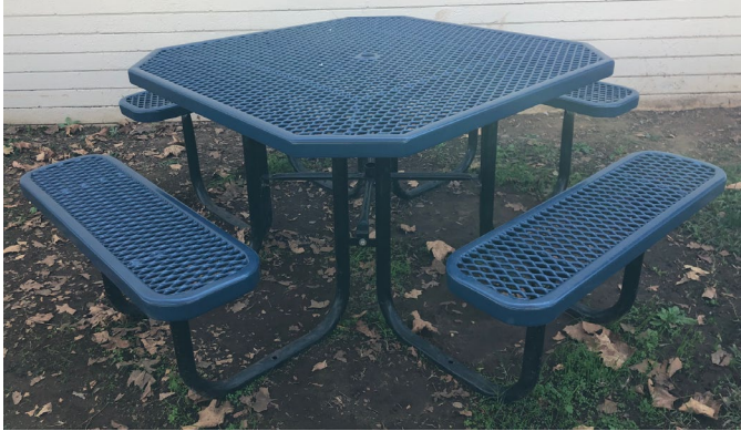
Octagon Shape Outdoor Table, 46" Top, Seats 8