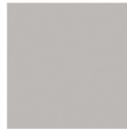
Fashion Grey #D381-01 Laminate

Activity Table, Half Moon shape, 36"W x 72"L, (adjustable height 22"-30"H), Laminate Color: Fashion Grey, High Gloss Dry Erase Surface with Black Band Edge